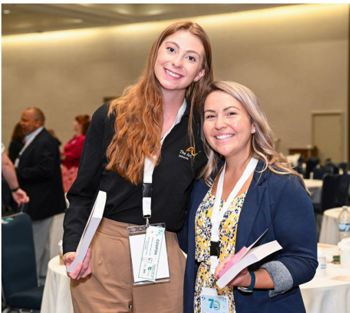
2025 Florida Conference on Aging, Orlando, FL